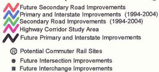
Figure 7-4 Transportation Improvement Program