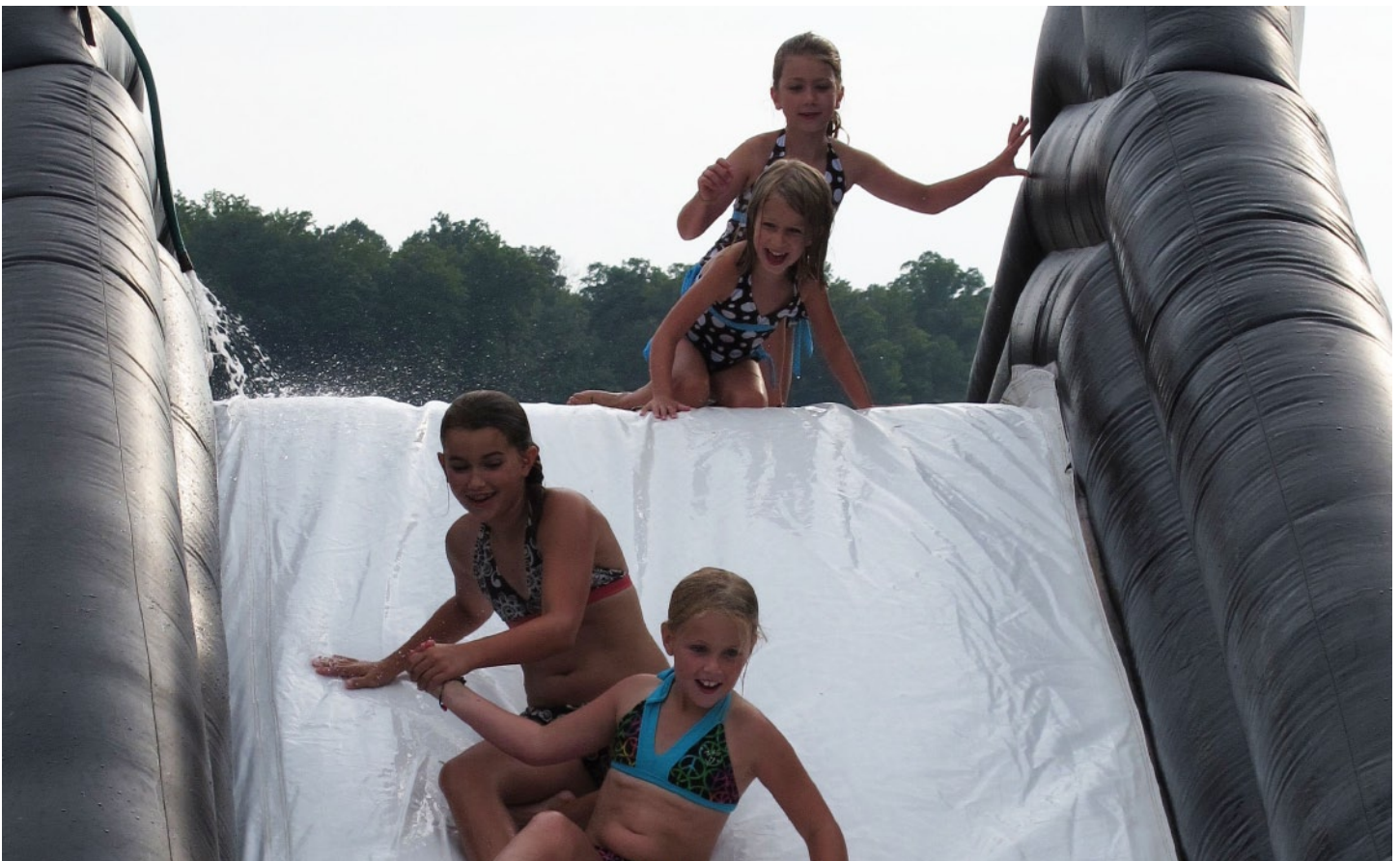
Beating the Heat! The water slide was a big hit at the Lake Caroline National Night Out celebration.