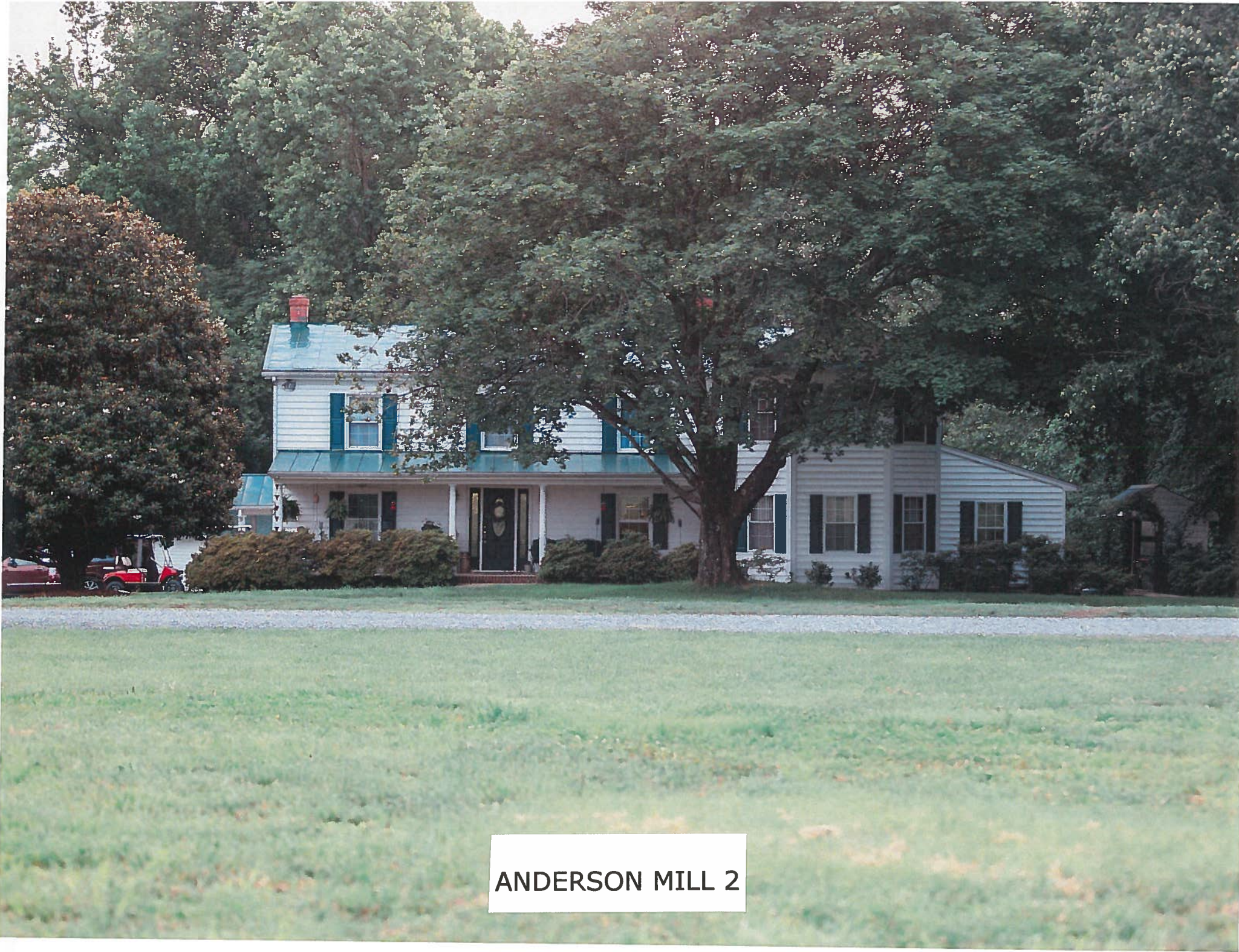
ANDERSON MILL 2