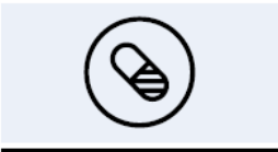
Pharmacy Partners / Programs