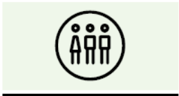
Mass Public Vaccination Clinics